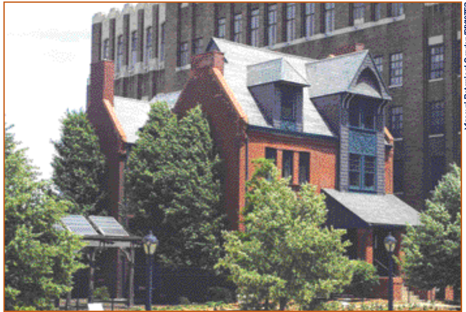
This Victorian home in St. Louis, MO, demonstrates the practical use of energy-efficient systems, including a 1.5-kilowatt solar-electric unit that powers all the kitchen appliances.

A variety of organizations have worked with the PV industry in the development of various codes and standards. Code requirements for PV systems vary somewhat from one jurisdiction to the next, but most requirements are based on the National Electrical Code (NEC). The NEC has a special section, Article 690, which carefully spells out requirements for