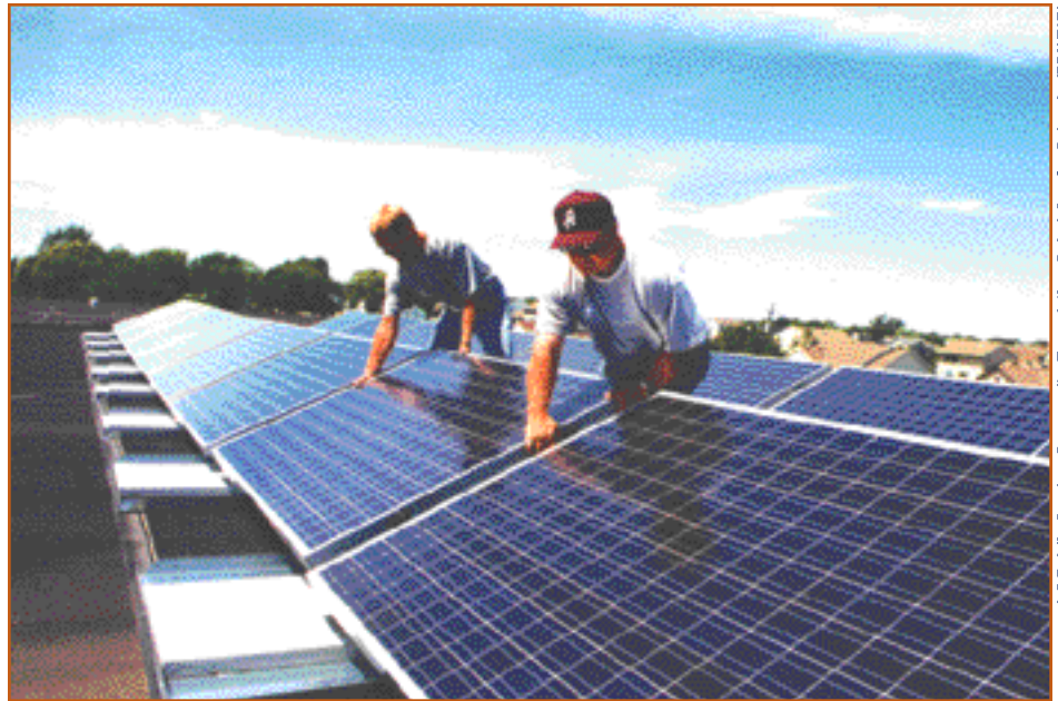
WI Public Service Community Foundation SolarWise for Schools (PX07631)

If a home is used for a business, system owners may be able to take advantage of federal financial support for PV technology through a tax credit for commercial uses of