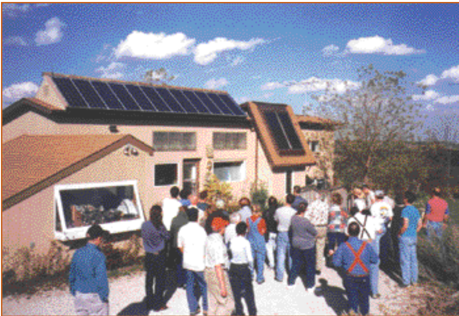
MSB Energy Associates/PI/0520

Net metering has been generally accepted as a way for states to encourage consumers to purchase renewable energy systems. Basically, net metering allows customers to only pay for their "net" electricity, or the amount of power consumed from the utility minus the power generated at the customer's home via the renewable energy system. Excess generation (power not consumed during the billing period) may be reimbursed at the utility's avoided cost (usually a much lower rate) or not at all. Once the utility has been contacted and has cleared a PV system for net metering, system owners should verify they are receiving credit. If the renewable energy system is generating more electricity than is being used in the building, the electric meter should be spinning in reverse. In most circumstances, the "old fashioned" meter with mechanical dials works fine. However, some newer electronic meters have trouble registering electricity flow in reverse. PV installers should know if there would be a problem with the meter.