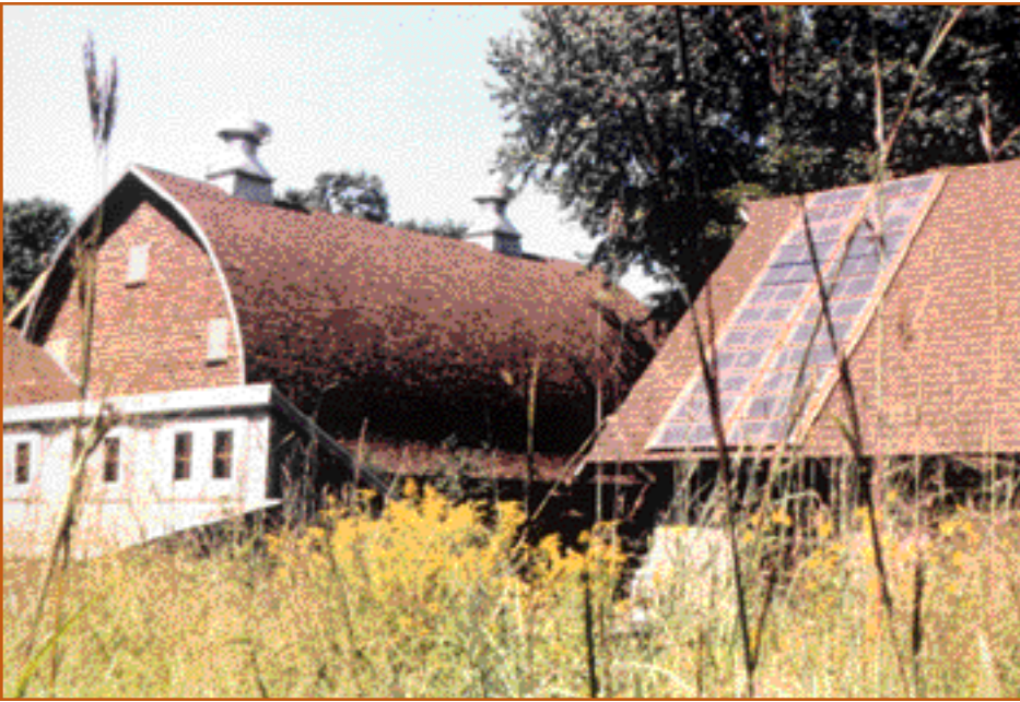
This nature center near Cedar Rapids, IA, uses solar electricity to run low-wattage, energy-efficient lights.

sumers should call the city and county in which they live for additional information on how to check on contractors. The Better Business Bureau is another source of information on contractors.